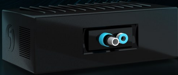
(logfive - O 3 Plug-in module prototype for sterilizers)