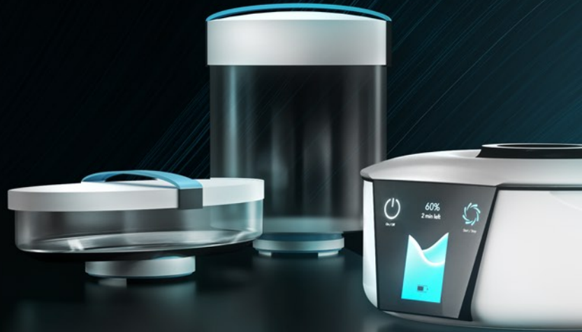
(logfive - O 3 Mobile Desinfector/Sterilizer Prototype 2.0)